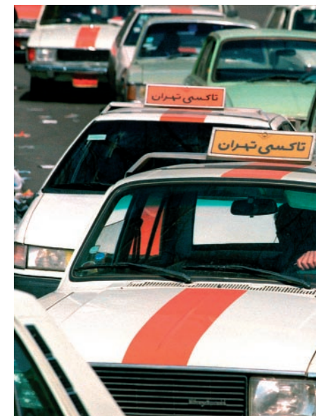
Taxis in Tehran have been converted to CNG

Iran's unique geographical position, sharing borders with 14 other countries, gives it a great opportunity to manufacture cars for